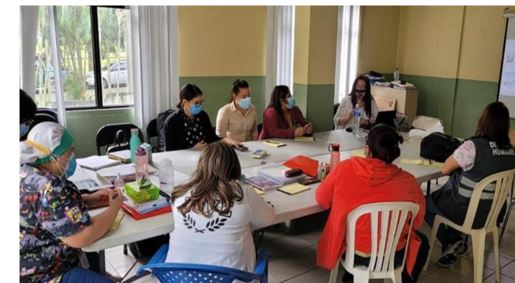
Workshop on strengthening APN implementation, Hospital Mario Catarino Rivas, SPS, Honduras 2022