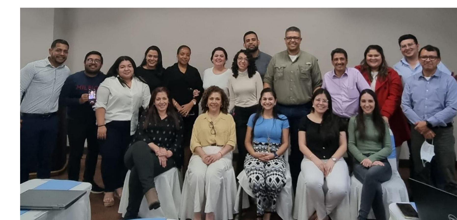
Health coordinators, supervisors, regional and national technical staff, country representatives, and managers participated in the workshop for reinforcing APN acceptance strategies, including the systematization of successful experiences, Tegucigalpa, Honduras, 2022.