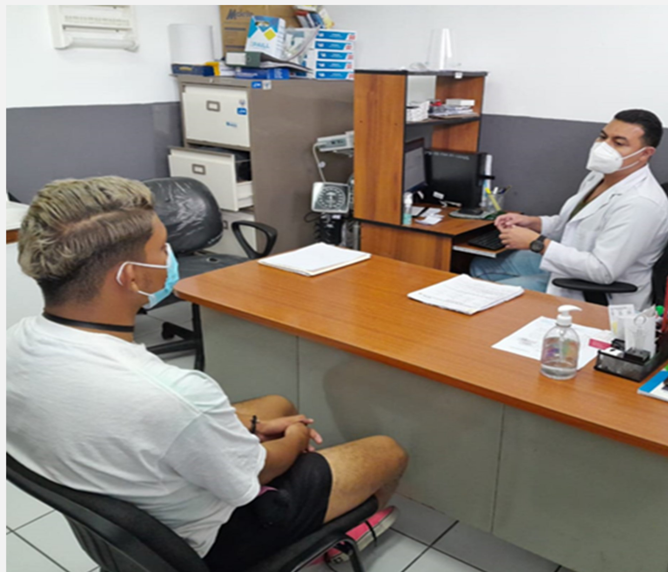
El Salvador’s first PrEP client enrolls in services at San Miguelito VICITS health clinic in San Salvador, September 2022. (Consent obtained & documented)

PrEP dispensation began in one VICITS facility in San Salvador in September 2022. In 2023, the MoH expanded PrEP to 11 additional VICITS sites.