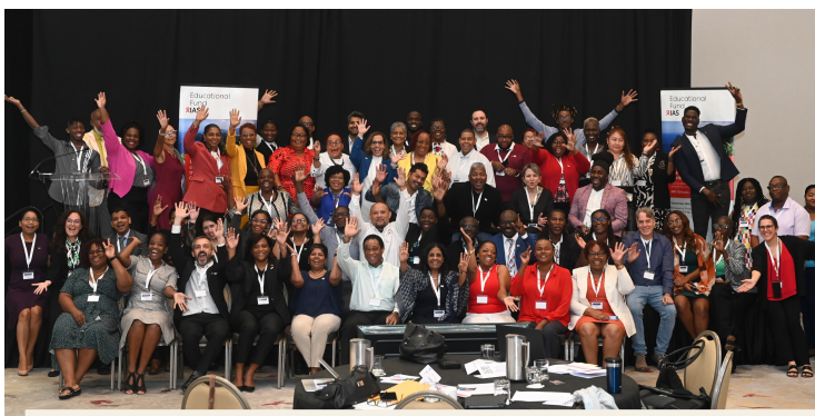
Workshop participants, Port of Spain, Trinidad and Tobago, November 2024

Participant in the 2024 IAS Educational Fund workshop in Tunisia