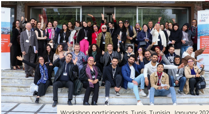
Workshop participants, Tunis, Tunisia, January 2024

Through its regional meetings and partnerships, the IAS Educational Fund encourages healthcare workers, researchers, community actors and policy makers to collaborate and catalyse action at global, regional, country and community levels on key recommendations presented and discussed during the meetings. The meetings aim to improve strategies, policies and HIV clinical practice at local and national levels. In 2024, the IAS reached 637 HIV professionals with its regional meetings.