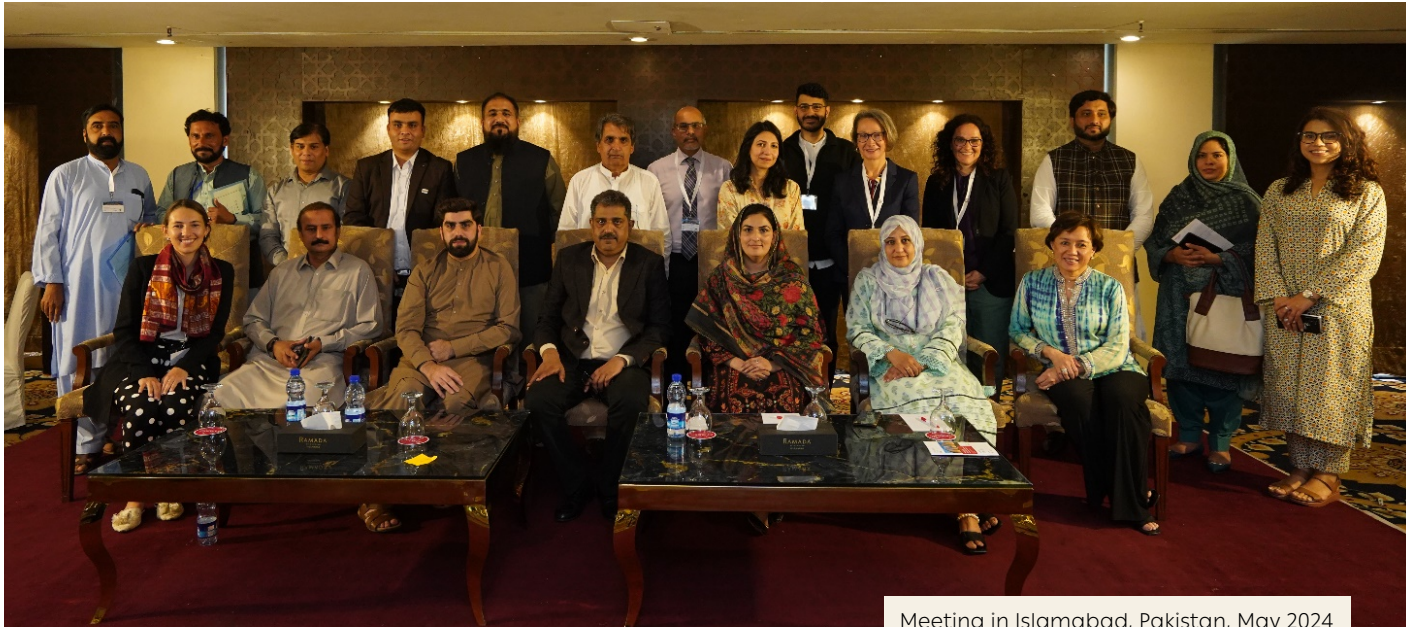
Meeting in Islamabad, Pakistan, May 2024

In Pakistan, the involvement and active participation of all stakeholders were consistently highlighted as a significant positive outcome by participants. There was widespread satisfaction that such an event was held in Pakistan, organized in partnership with local organizations Nai Zindagi Trust and Aga Khan University and focusing on carefully selected themes.