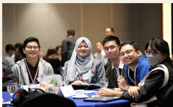
Workshop participants, Manila, the Philippines, March 2024