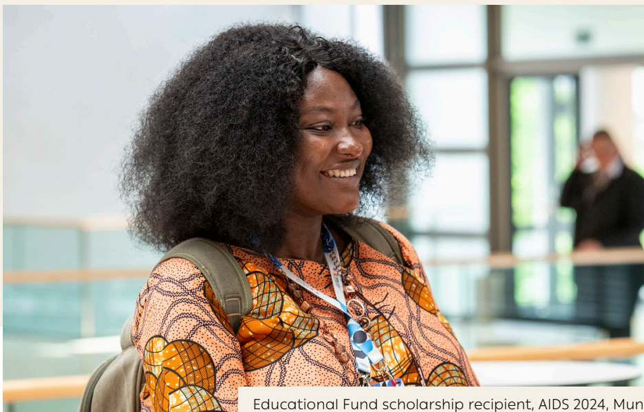
Educational Fund scholarship recipient, AIDS 2024, Munich, Germany, July 2024

Non-binary social worker South and Southeast Asia