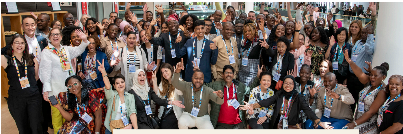
Educational Fund scholarship recipients, AIDS 2024, Munich, Germany, July 2024

For AIDS 2024, the 25th International AIDS Conference, the IAS Educational Fund provided support to 106 scholarship recipients (76 clinicians and HIV service providers and 28 advocates) from 44 countries.